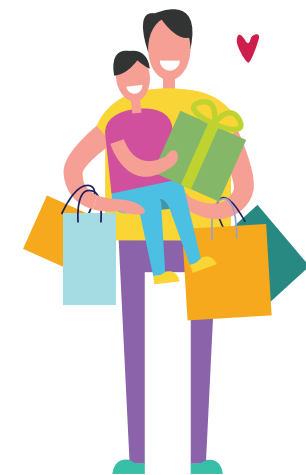
Customer Redeems Printed Certificates

The Business keeps a record of all purchases made and manages any gift voucher balances through their own in-store credit process