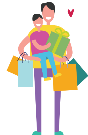
Customer Redeems Printed Certificates

The Business keeps a record of all purchases made and manages any gift voucher balances through their own in-store credit process